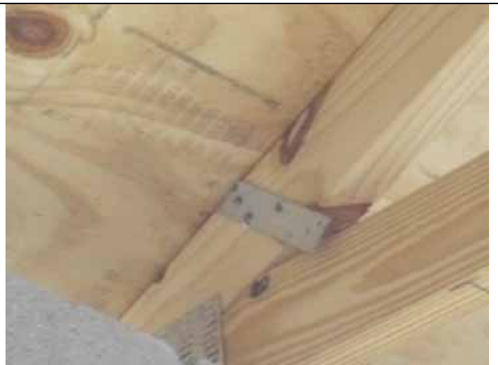
Roof to wall attachment