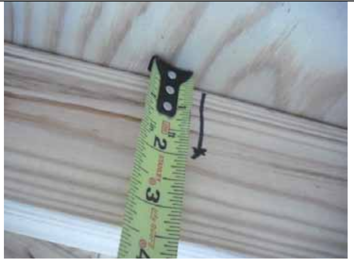
Roof deck attachment