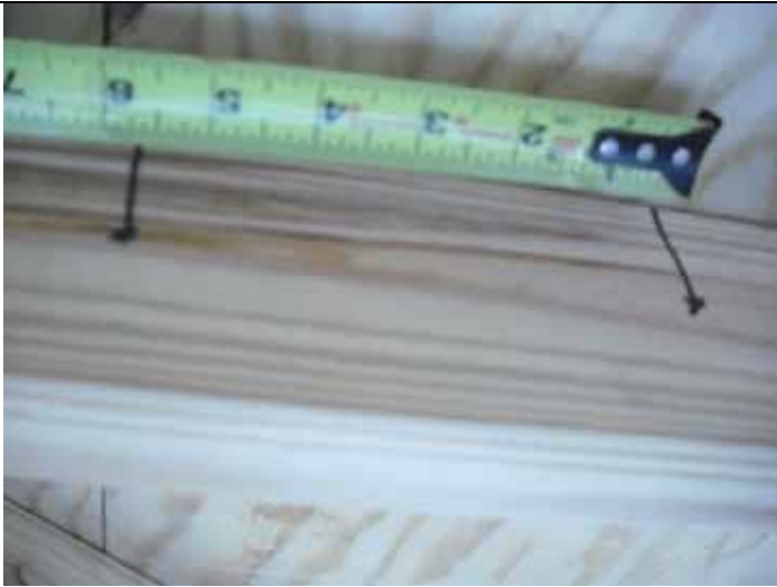
Roof deck attachment