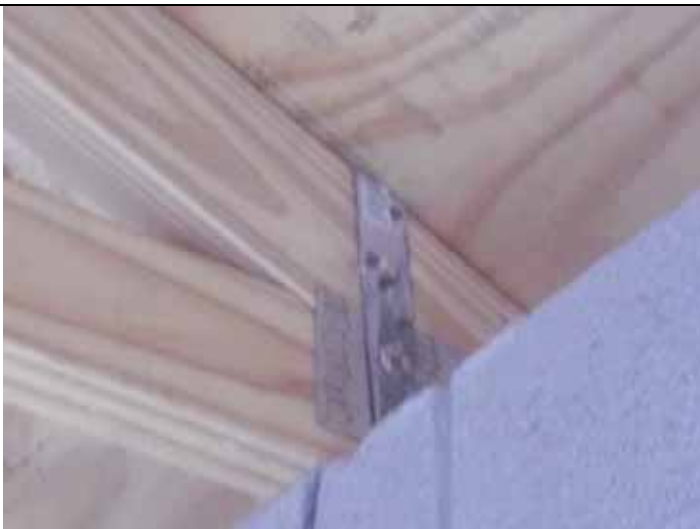
Roof to wall attachment